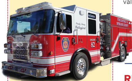
Engine 82 proudly serving Valleyford.

As always, if you have any questions about our service, or suggestions about how we can serve you better, please feel free to e-mail me at lrash@scfd8.org , or give me a call on my cell phone at 509-370-9801.